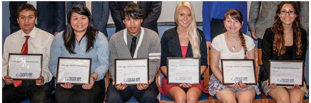
Class of 2018 Award Recipients